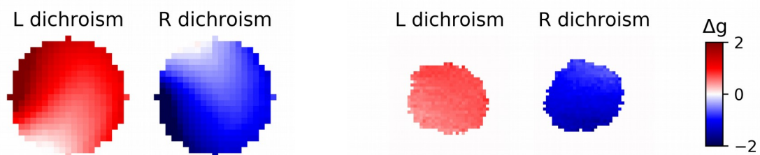
Figure 3. (left)